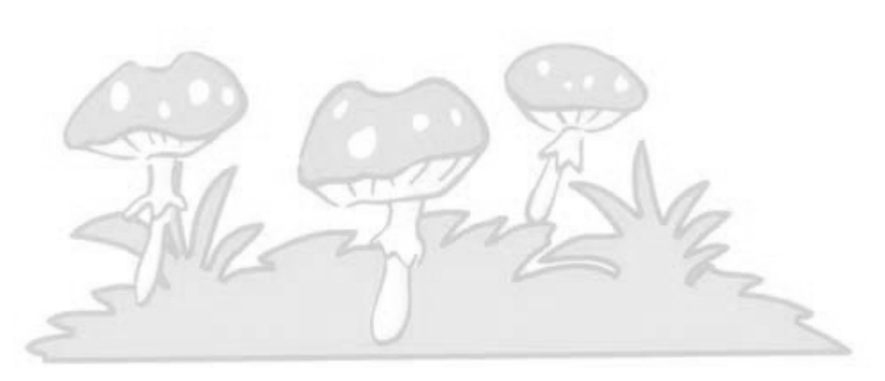
Artwork by Nursing & Quality Department (January 2004) Updated 2014 Copyright West Lothian CAMHS 2014

If you can deal with any incident calmly and fairly, you will encourage your child to learn from their mistakes and make them less likely to repeat the act.