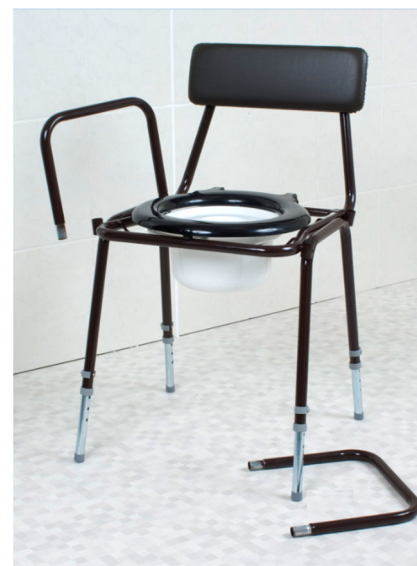
F19455 Adjustable Height & Detachable Arms