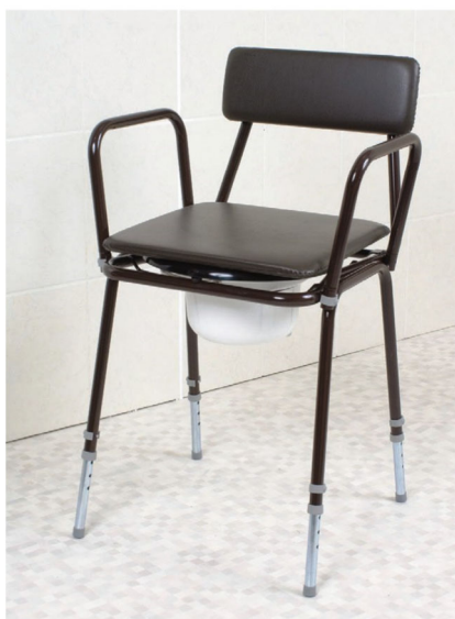
F18864 Adjustable Height

Please ensure these instructions are fully read and implemented. Failure to do so may result in injury to the user. Retain in a safe place for future reference.